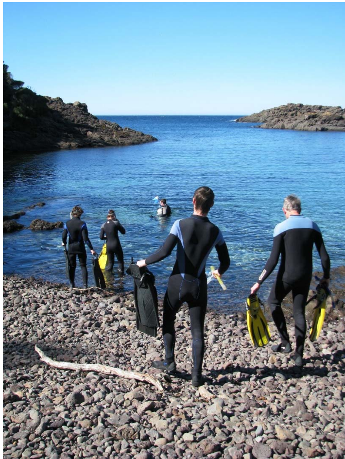
Stage 6 Marine Studies Excursion